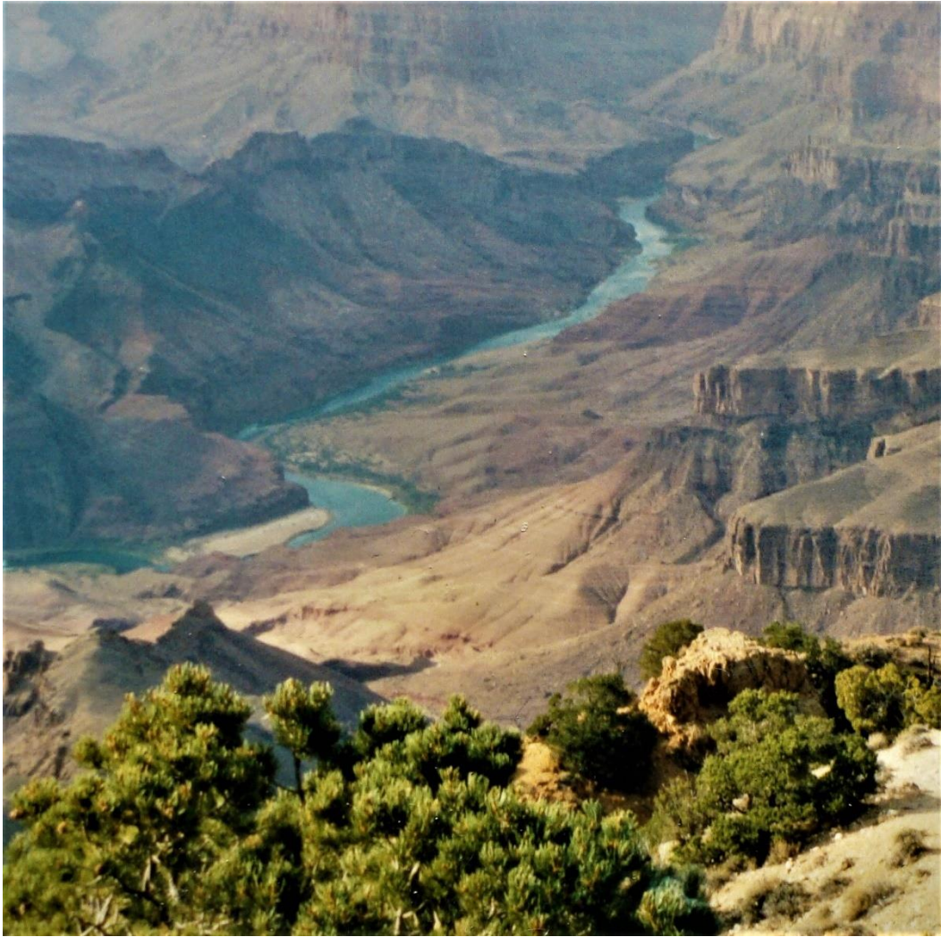
A river in a miles-long canyon of trees and grass