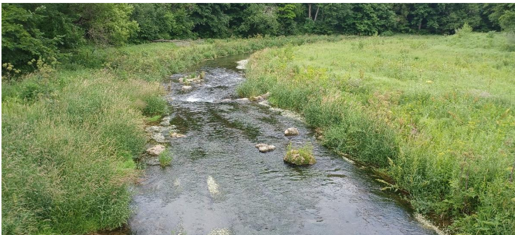
A gushing trout stream