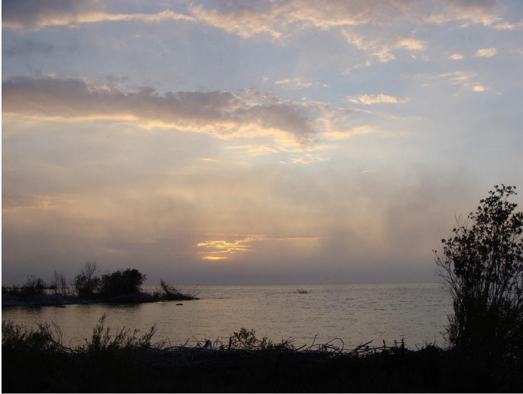
Mist rising over a sea at sunset