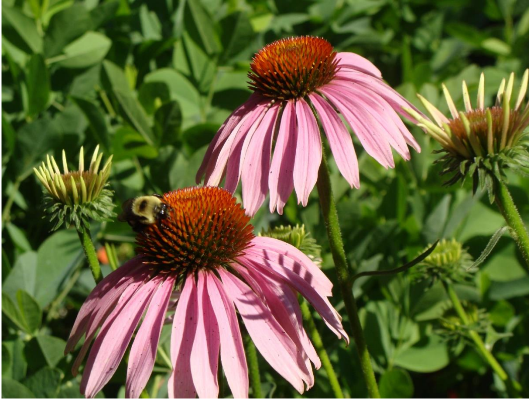
Bee on a red heart surrounding by light-violet petals