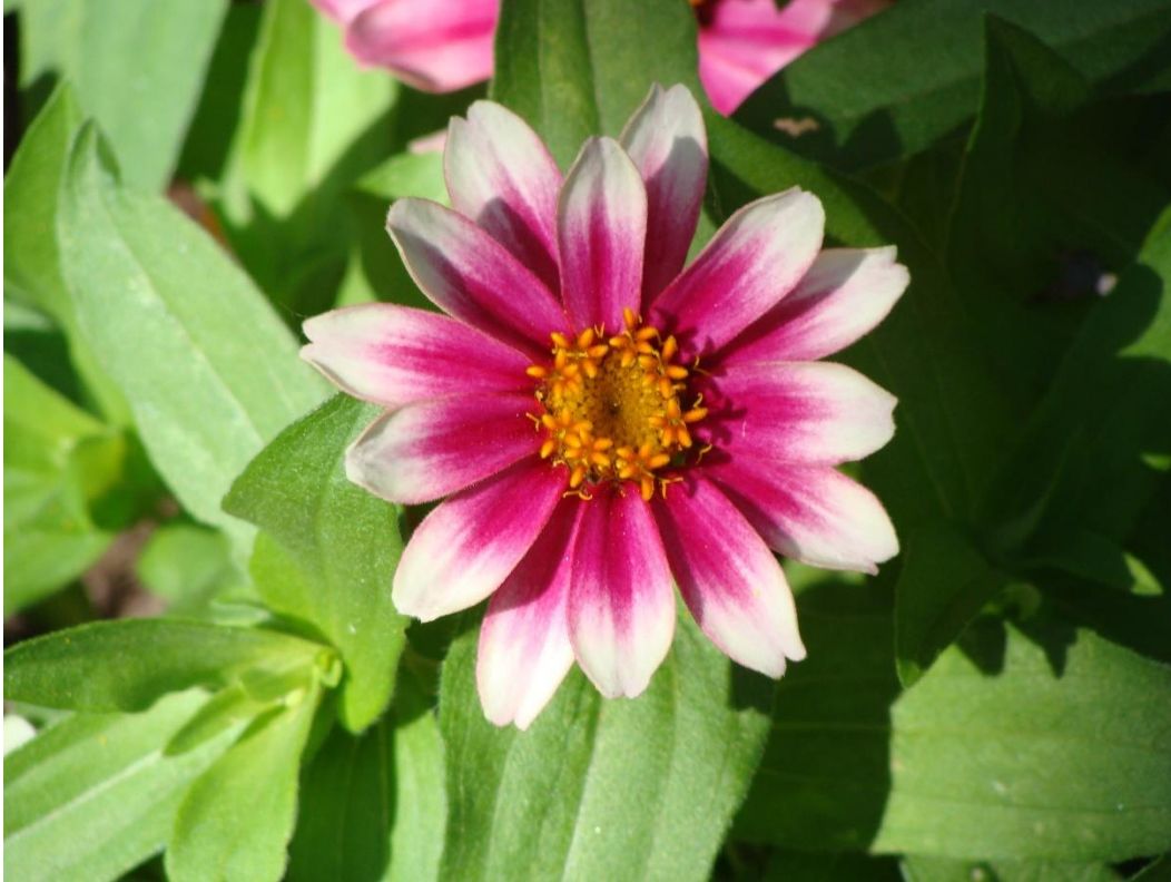
Violet center with gold highlights