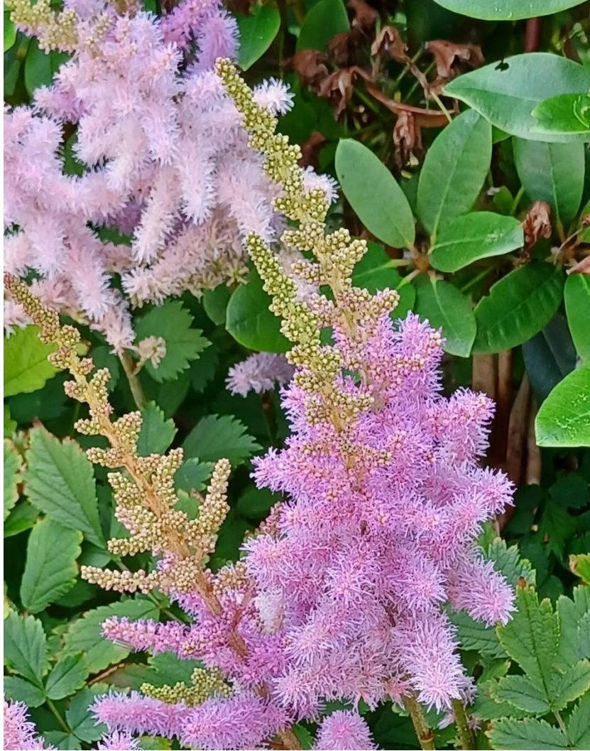
Clouds of small purple petals and green buds