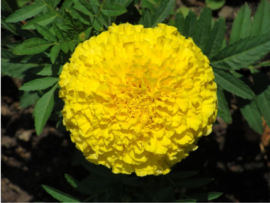
Large, bright-yellow flower like the sun