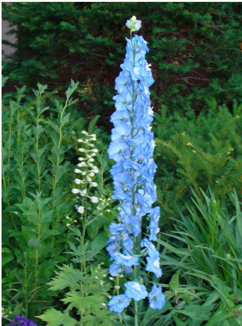
A fountain of blue flowers on a tall, narrow stem