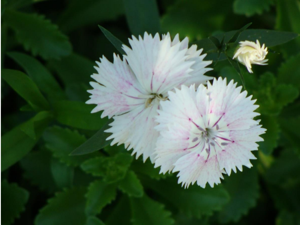
White flowers with purple strands from the core