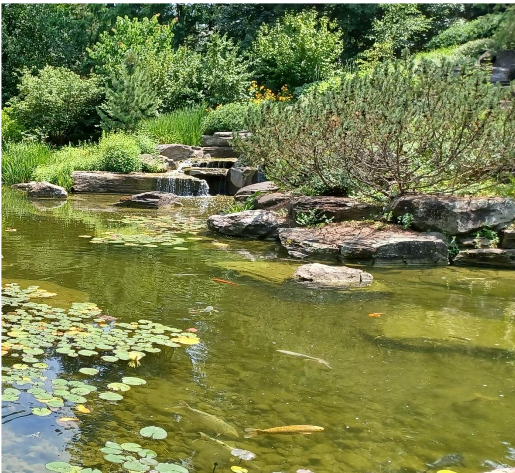
Landscape design © Frederik Meijer Gardens. Used by permission