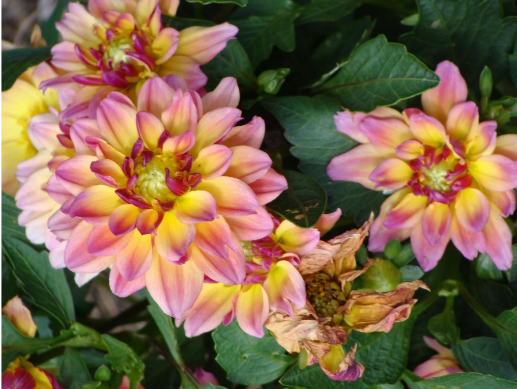
Flowers with many purple and yellow petals and green centers