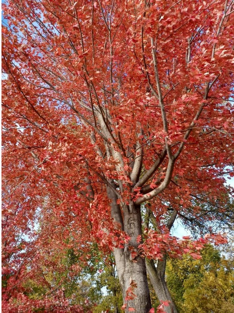
Bright red leaves on three trees, seeking sun