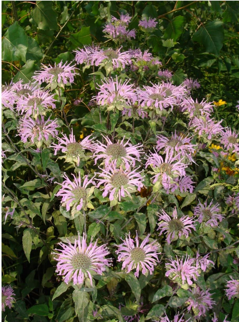
Many Flowers with Purple Petals and Green Centers