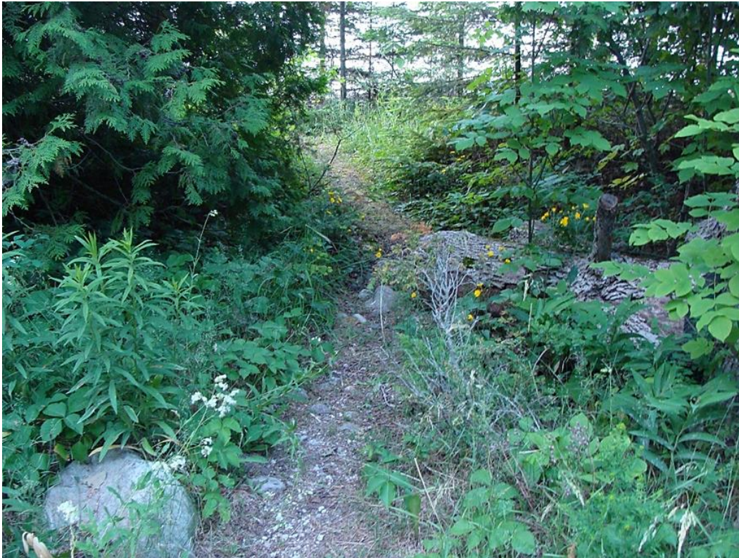
A flower-strewn path through woods to endless waters