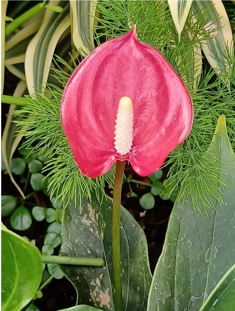
A white pistil and stamen all in one, enfolded in a red petal